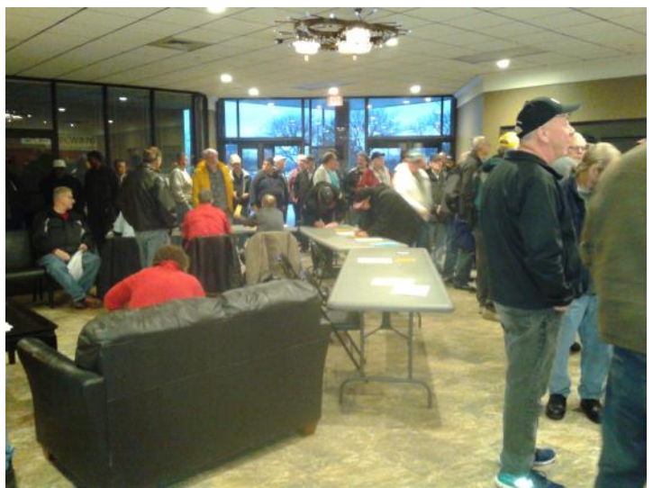
Doors open in 3 minutes and the lobby is filled with eager attendees hoping to be the first to find the good deals.